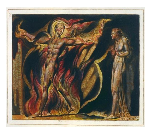
Blake's Paintings reflecting on artistic freedom of thought and expression

Provided By: Soumyadeep Chakraborty (SDC) April, 2020.